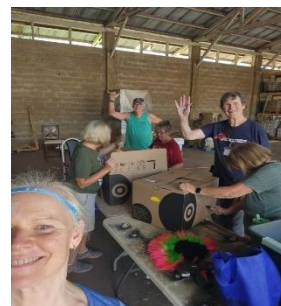
HOP was well represented at a recent Habitat Build in Hawaii!