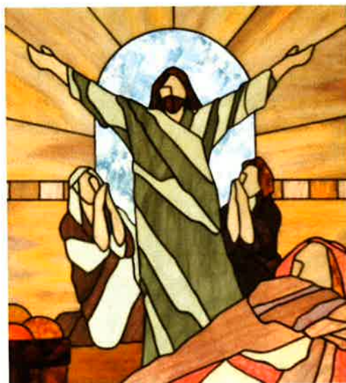
The Stained Glass Windows of House of Prayer Lutheran Church A Self-Guided Tour

916 Main Street Hingham, Massachusetts 02043 617-749-5533 www.houseofprayerhingham.org